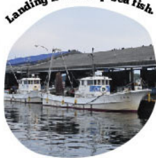
Landing fresh deep-sea fish

There are only four "offshore trawl fishing boats" in Aichi Prefecture that catch deep-sea fish. All of them belong to fishing ports in Gamagori City, making Gamagori famous for deep-sea fish. In fact, more than 90% of the deep-sea fish in the prefecture are landed in Gamagori. It is fatty and very tasty because it can withstand the water pressure of the deep sea. In particular, the deep sea off Mikawa Bay, where the rich nutrients of Mikawa Bay flow into the sea, is said to be one of the most blessed fishing grounds in Japan, and the deep-sea fish caught in Gamagori are reputed to be very delicious.