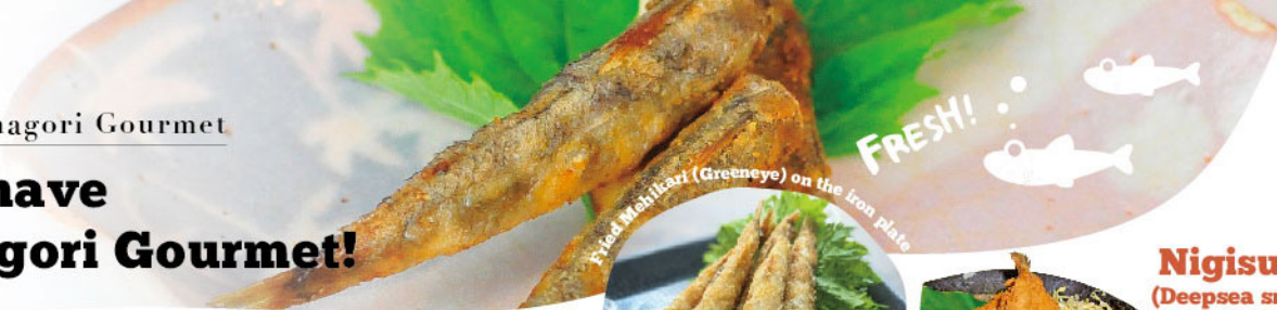
Fried Mochikari (Greeneye) on the iron plate

Gamagori has a lot of sunshine per year, and facility cultivation is thriving in the area. Please try a "red Jewel" that is the fruit of the growers' efforts.