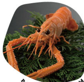
Princess of the shrimp world

This shrimp is endemic to Japan and lives at depths of 200 to 400 meters. It is a very high-end foodstuff because it cannot be farmed. The flesh is extremely soft and has a strong flavor and sweetness.