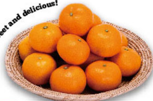
Very sweet and delicious!