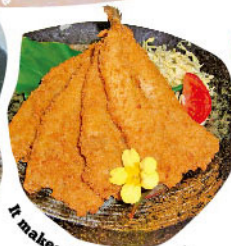
It makes one have a good

Fried white fish in Gamagori is the fried nigisu. You can enjoy its deep flavor and refreshing taste. The dumpling soup is also very tasty.