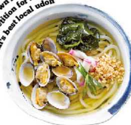
Won the triple crown in a national competition for local udon noodles Japan's best local udon