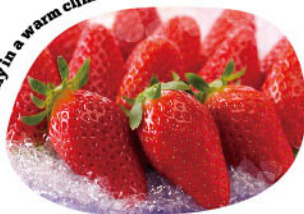
Only in a warm climate

With a warm climate surrounded by the sea and mountains, greenhouse mandarin oranges and outdoor mandarin orange cultivation are popular. You can enjoy various varieties of mandarin oranges throughout the year.